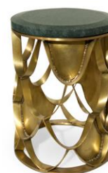
KOI Side Table

Press Relations | Tiago Gonçalves press@brabbu.com | skype: t.andre.goncalves +351 222010850