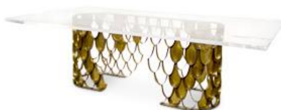
KOI Dining Table II

The new addition comes to complement the set of two dining tables, a center and a side table, and also the screen and rug. An iconic family that has its roots in Japan but that travelled worldwide and can now be seen in many projects around the world.