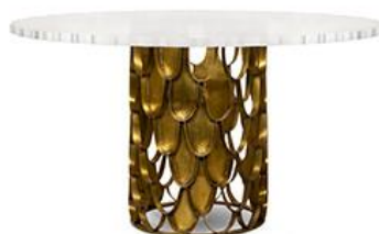
KOI Dining Table I