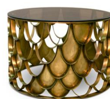
KOI Center Table